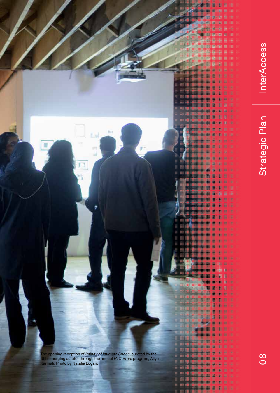
The opening reception of Infinity of Intimate Space , curated by the 15th emerging curator through the annual IA Current program, Aliya Karmali.